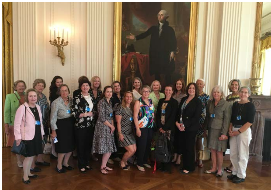
DC Dames pictured in the White House East Room in front of the portrait rescued by Dolley Madison during the War of 1812

All three fall Excursions were fully subscribed with waiting lists. There was a trip to Glenstone in Potomac, followed by two special afternoon visits to the White House. The photos from those trips show how much they were enjoyed. Upcoming Excursions in the spring will be announced via email.