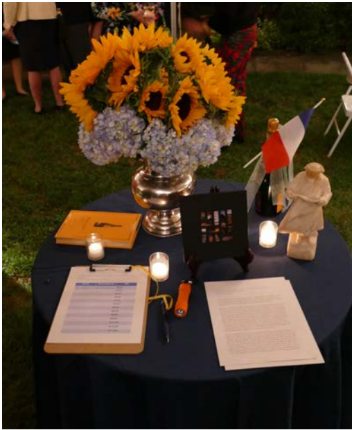
A special Auction display for the home in France