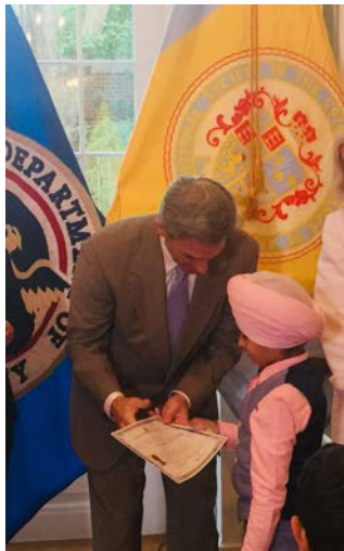
Ken Cuccinelli presented the children's citizenship certificates.