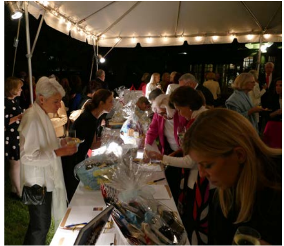
Silent Auction table