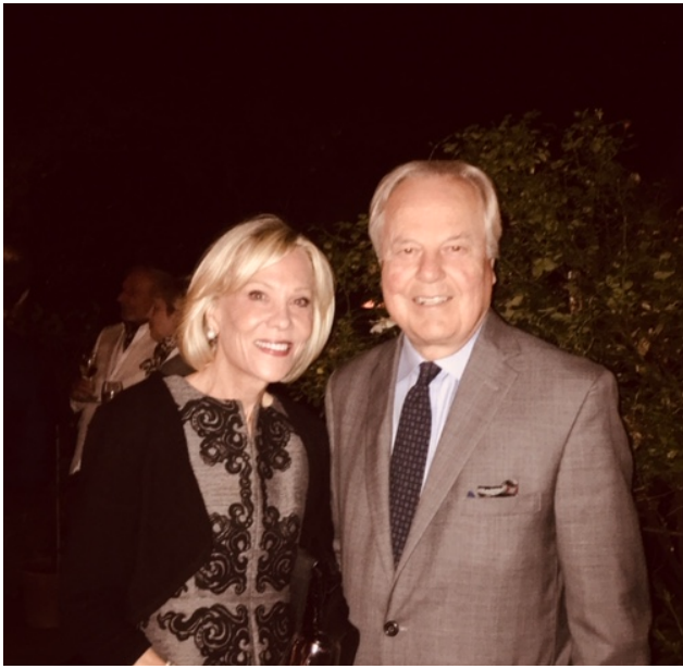
Connie Harriman and her husband, Ed Whitfield