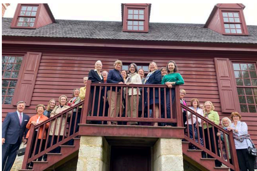
DC Dames enjoying the autumn trip to Fredericksburg are pictured at Ferry Farm.

All three book clubs (Evening Explorers, History Hounds, and Literary Ladies) continue to thrive. The HAC also is exploring other projects, including a strong interest in working with an invigorated committee seeking to restore and improve the neglected Mount Zion/Female Union Band Society Cemetery, just east of Dumbarton House. See the explanatory article on page 16.