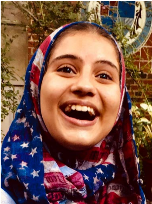
A new citizen!