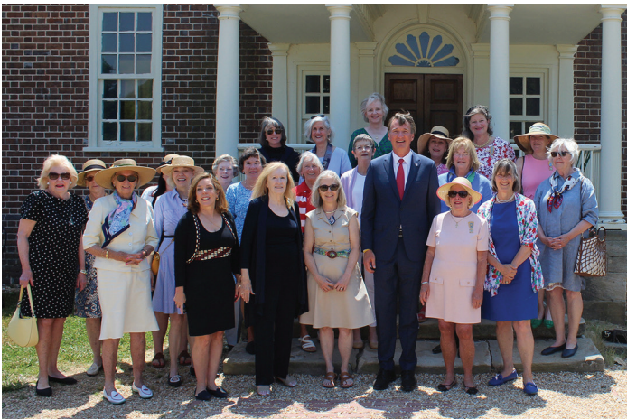
Pictured with Virginia Governor Glenn Youngkin are Colonial Dames from the DC, VA, WVa, and MD Societies as well as Regents to Gunston Hall.

Governor Youngkin was the keynote speaker at the June 10th Naturalization Ceremony. On this Declaration Day celebrating the 247th anniversary of the Virginia Declaration of Rights, we witnessed the oath of citizenship given to 50 new U.S. citizens from 20 countries.