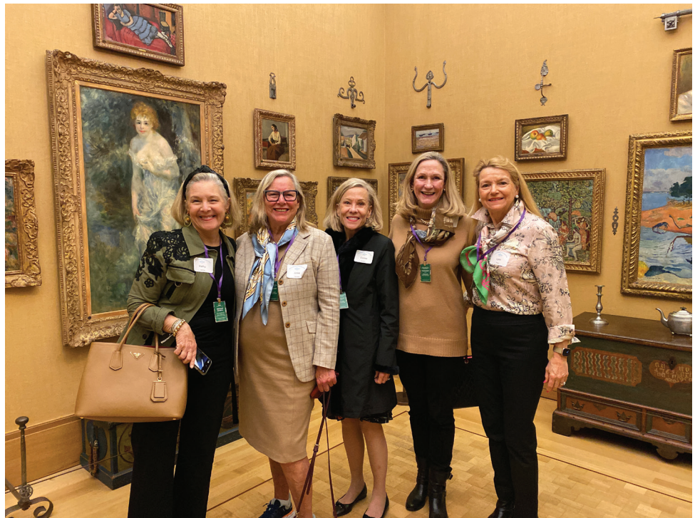
Dames at the Barnes Foundation in Philadelphia.