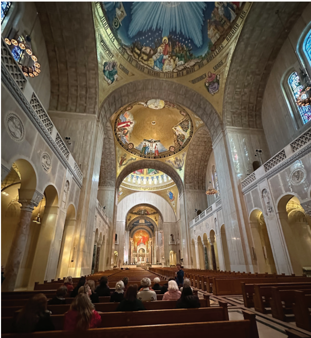
26 Dames had a private tour of the largest Roman Catholic Church in North America. The Basilica of the National Shrine of the Immaculate Conception.