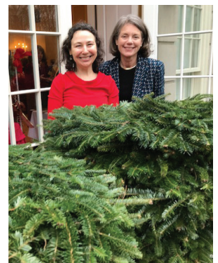
These photos capture some of the magical moments of the 2022 Christmas Tea!