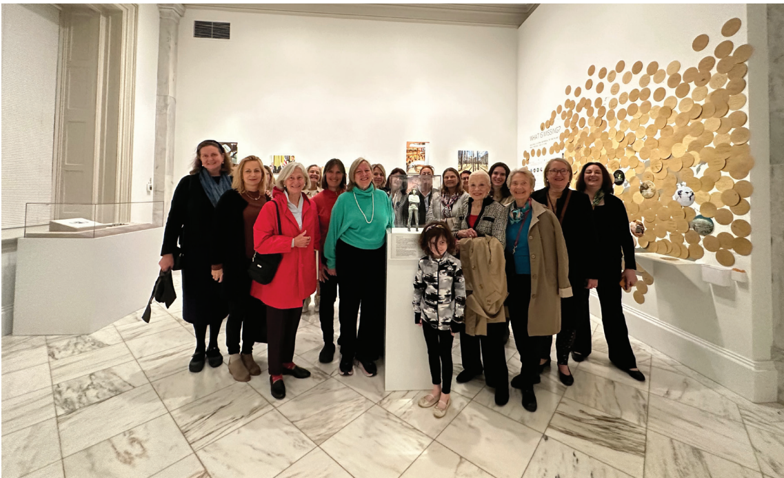
Dames and future Dame for the docent led tour of the special Maya Lin exhibit at the National Portrait Gallery.