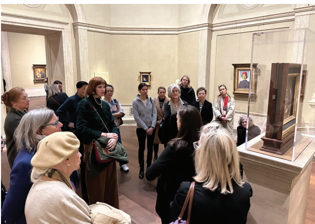
Dames gathered for a “Highlights of the Collection” private tour given by an official National Gallery of Art lecturer.

Thank you to all those supporters of the excursions. We look forward to more special events together!