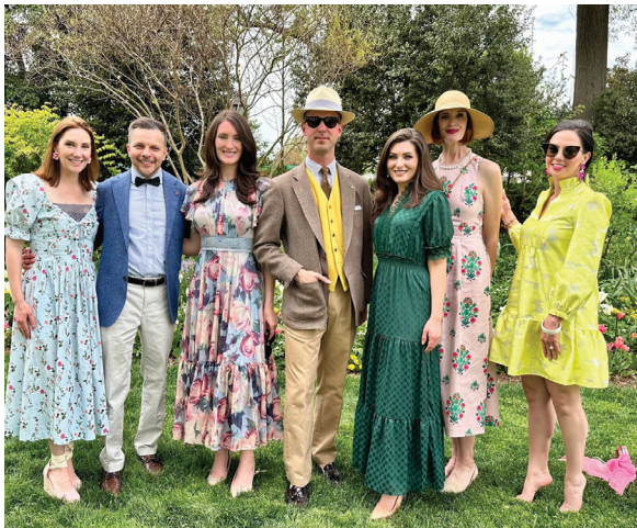
Dames gather before the Hunt Brunch held at the Chevy Chase Club April 16, 2023.

Since June of 2022, at six NSCDA-DC Board meetings, the Board welcomed 29 official candidates for membership. Of the candidates elected, nine were legacies. Many of the candidates elected over the past year have completed their lineage paperwork and are now members.