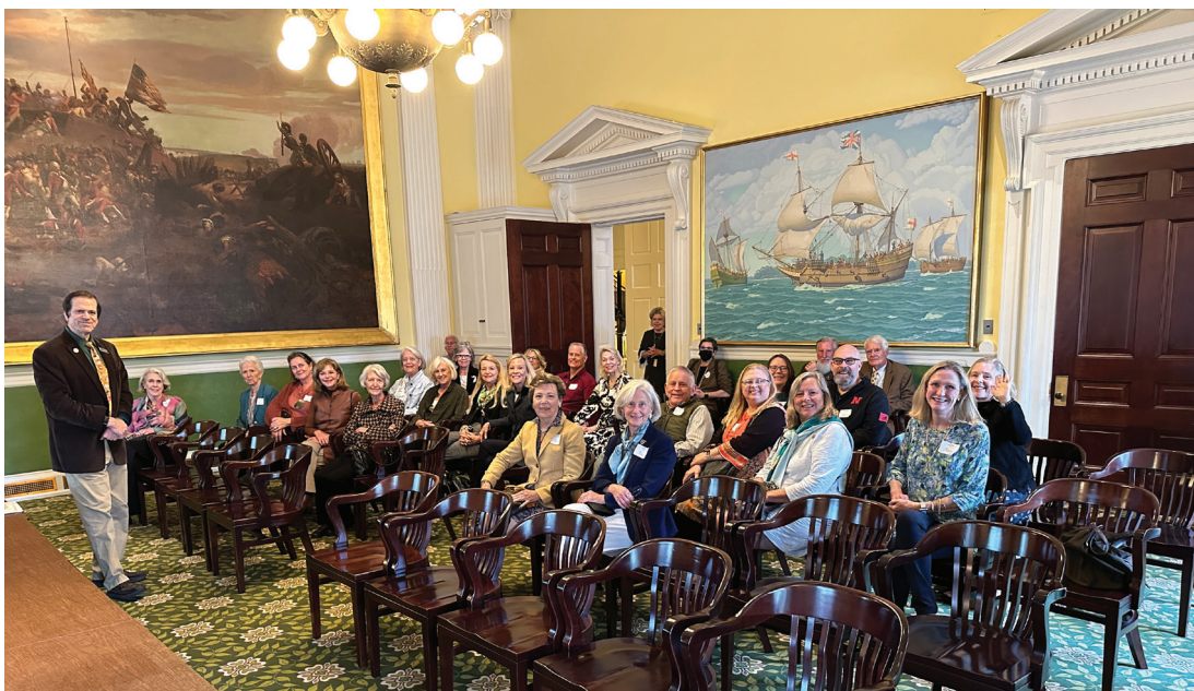
Dames enjoy a trip to Richmond.