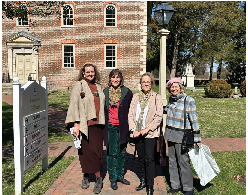
In celebration of George Washington's birthday, a group of 22 Dames and Friends toured the historic Pohick Church in Lorton, VA (built 1772).