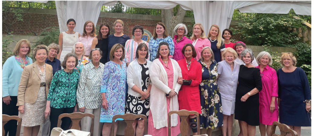
The current board photographed after the June 7 meeting.