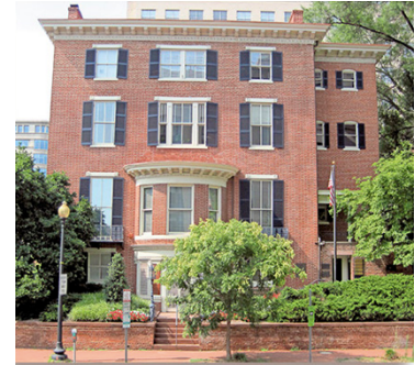
DACOR Bacon House