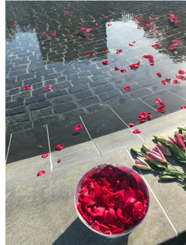
Rose petals scattered in the circular pond in front of the Memorial.